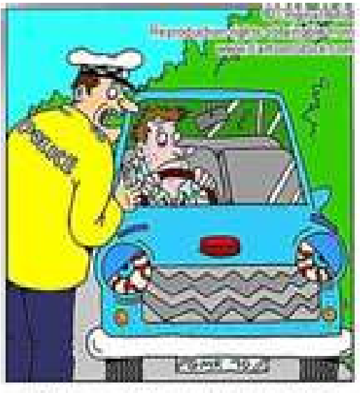
" Would you mind blowing into this bag sir ? "