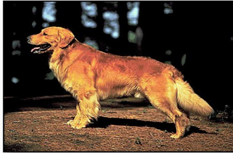
Yellow lab mutt