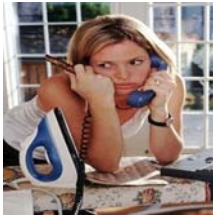
hold the line