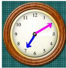
Ten past seven