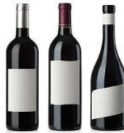
Bottles of wine