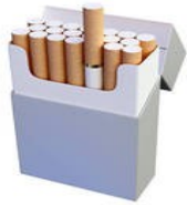
Pack of cigarettes