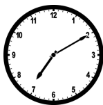
Ten past seven