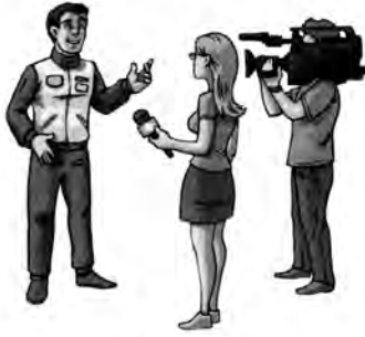
a TV reporter