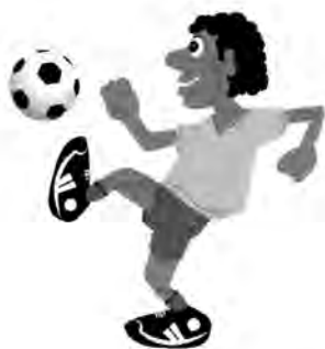
a football player