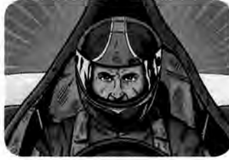
a racing-car driver