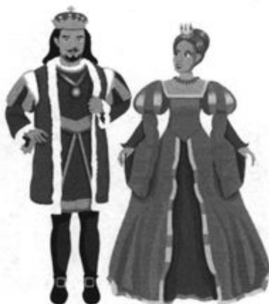
a king a queen