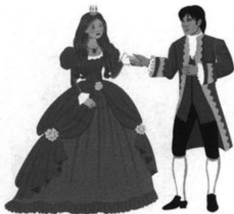
a princess a prince